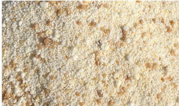
▲ Uniform particle size ensures that Spectrum Fusion delivers results in every bite

Welcome to the Fusion of quality assurance, fatty acid nutrition, and rumen protection technology.